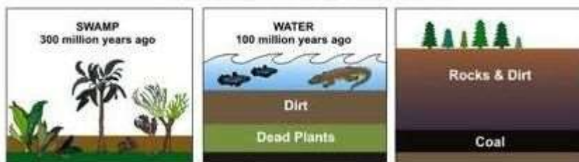
Formation of Coal

Ans: Dead remains of plants got buried under the earth millions of years ago. Due to intense heat and pressure inside the earth they got converted into coal. The process of conversion of dead remains of plants into coal is called carbonization .